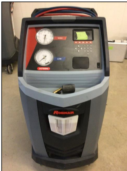
Robinair AC R-134A