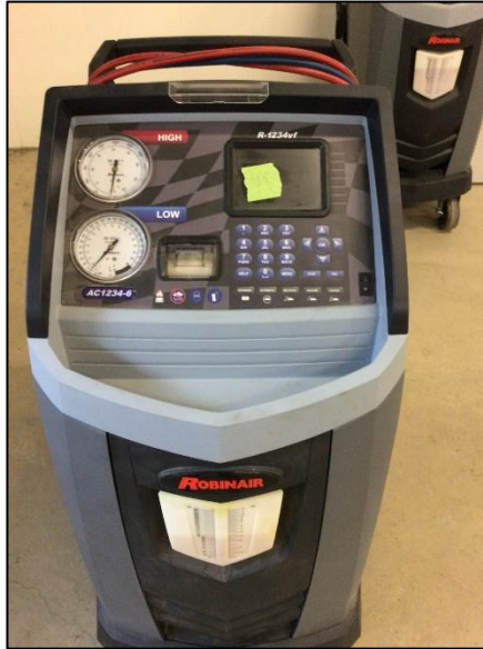
Robinair AC R1234 YF